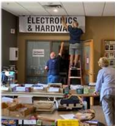
Good signage makes for easy shopping