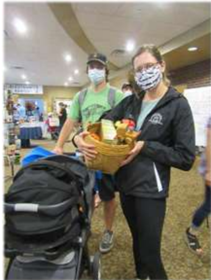
Many young families came to buy for their children