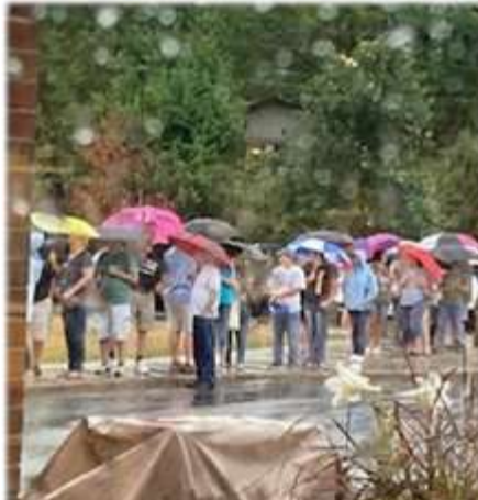
Rain fell as people waited for the 8 am start