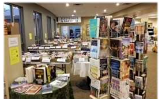
Books and tapes were totally by category for easy shopping